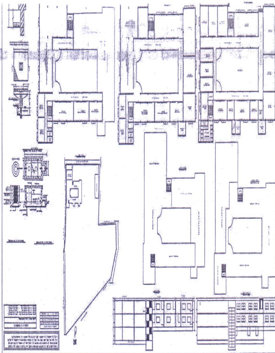
BUILDING PLAN OF THE GANDHI CENTENARY B.T.COLLEGE.HABRA.